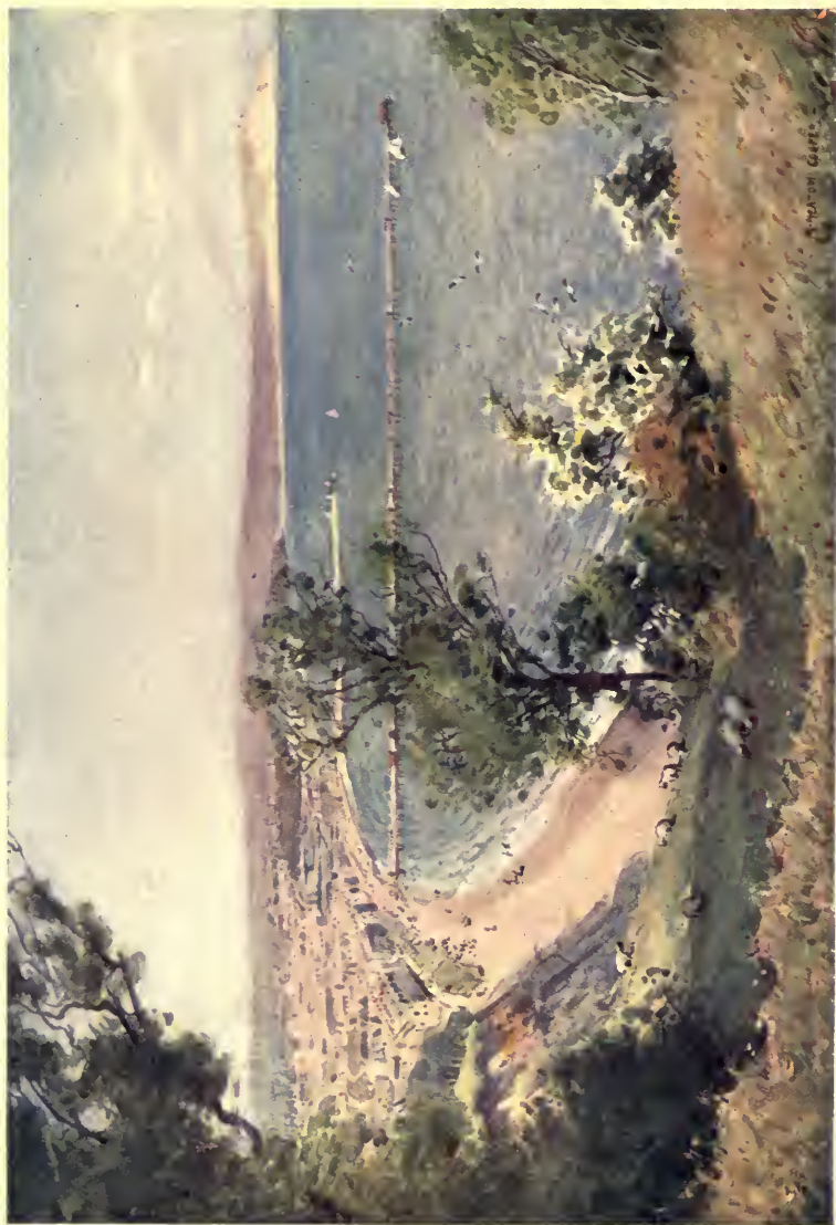
RAMSEY BAY, LOOKING NORTHWARD.

Ramsey is the second town in size in the island and like Douglas faces East.